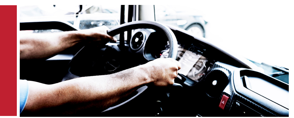
We know driver retention is tough, this is why we offer standard equipment such as; Bluetooth Radio, Air ride drivers seat, USB charging port, A/C, cruise control, tilt & telescopic steering wheel, making the job more enjoyable, potentially leading to increased job satisfaction and driver loyalty. That's why its STANDARD.

Hino Trucks provides extra-wide door openings, large step surfaces and grab handles to assist drivers with cab entry and exit. Hino's optional Safety Suite includes a Collision Mitigation System with Adaptive Cruise Control, and Lane Departure Warning in addition to an Antilock Brake System and Electronic Stability Control.